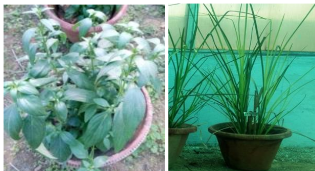
(a) A. paniculata