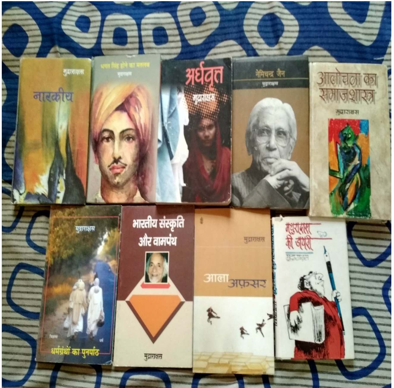
Figure 2. Some Important Books of Mudrarakshas