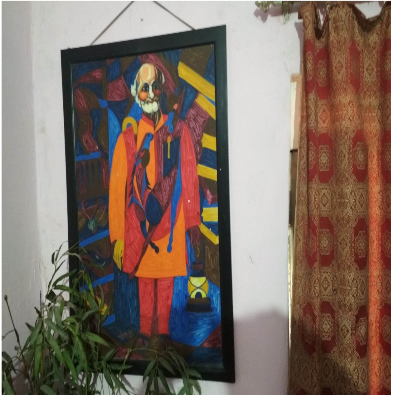
Figure 7. Portrait of Mudrarakshas