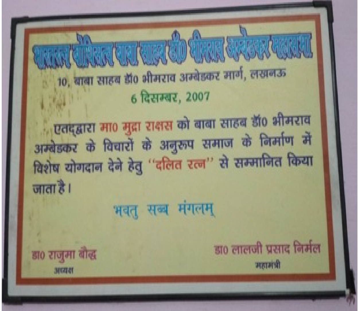
Figure 4. Title of Dalit Ratna awarded by Ambedkar Mahasabha