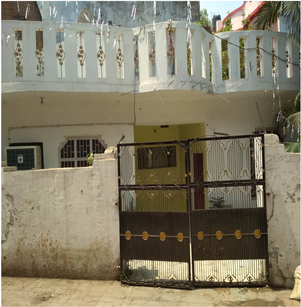
Figure 1. House of Mudrarakshas in Aminabad, Lucknow