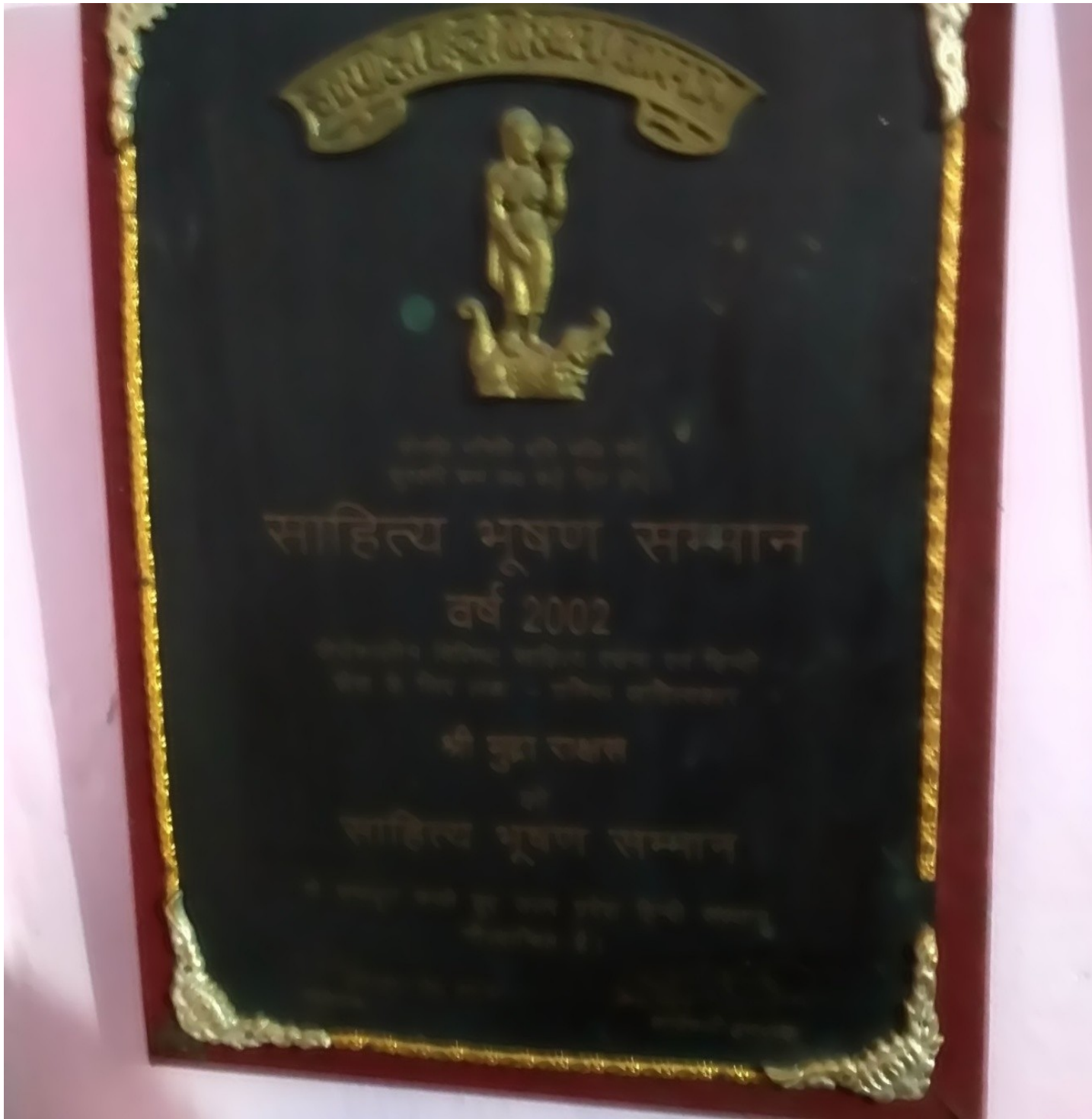
Figure 8. Sahitya Bhusan Award to Mudrarakshas in 2002.