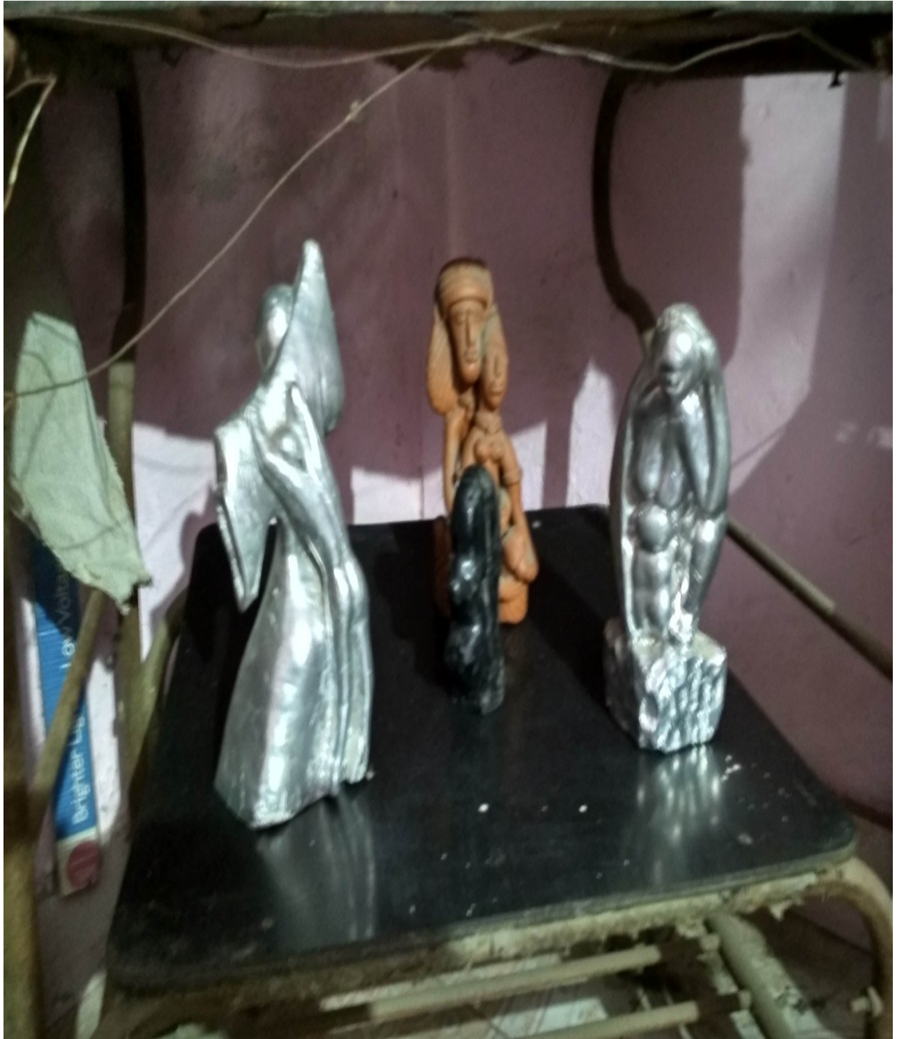
Figure 6. Sculptures made by Mudrarakshas