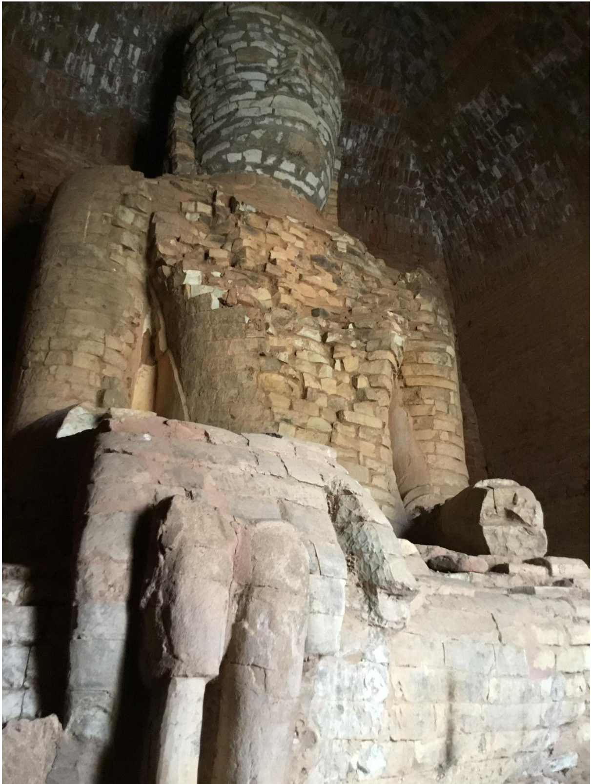
Figure 9- ‘Thandawgya’stone Buddha image (6 metre high) was built in 1284, using the tuff from Mount Popa.