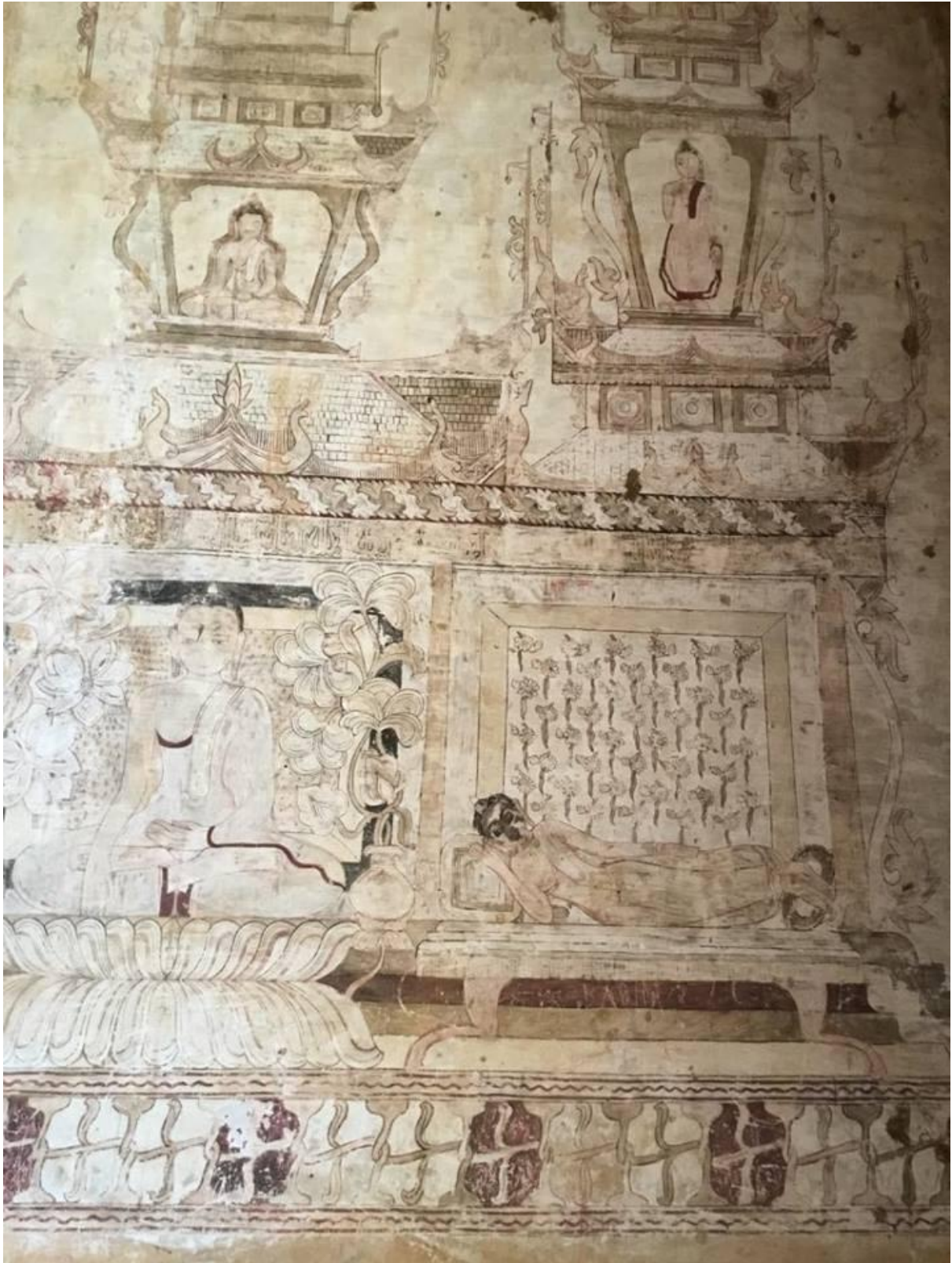
Figure 5- Mural painting on corridor wall inside Sulamani which was built in 1183 AD.