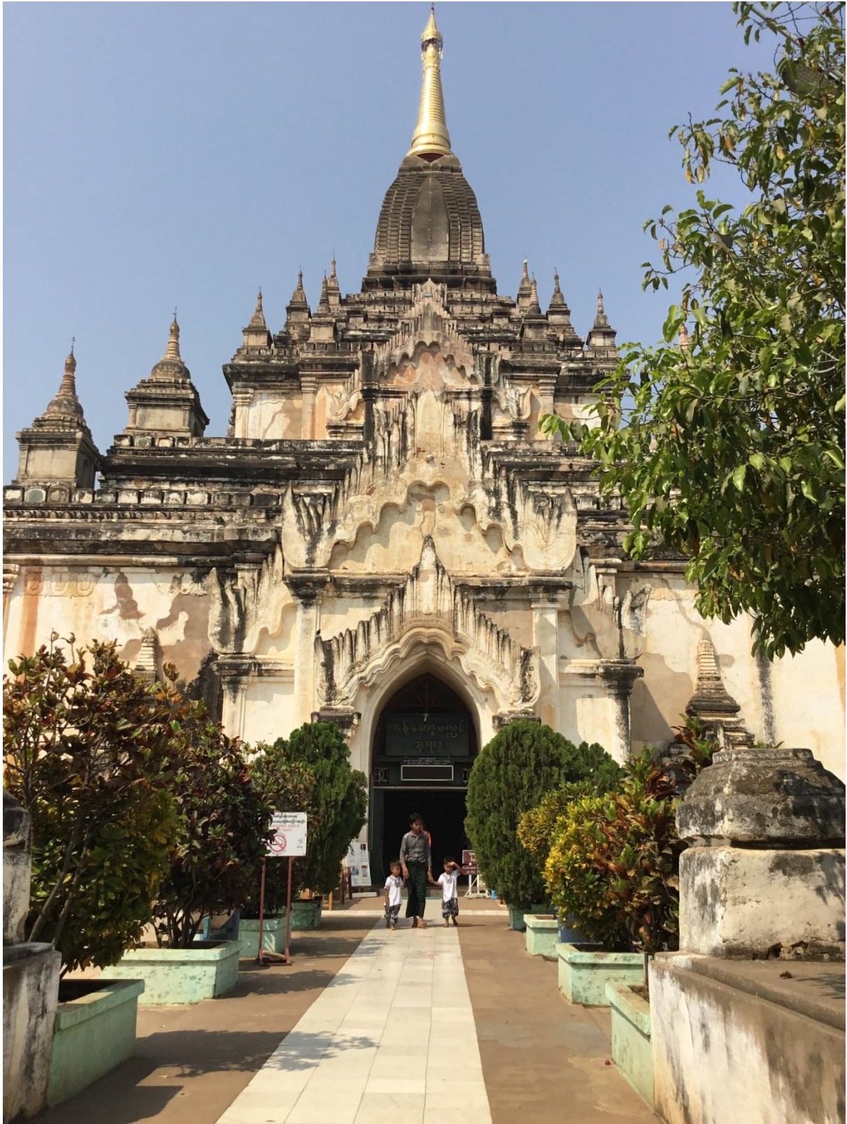
Figure 6- 'Gawdawpalin' a cave temple built in 1203 AD during the reign of King Narapatisithu.