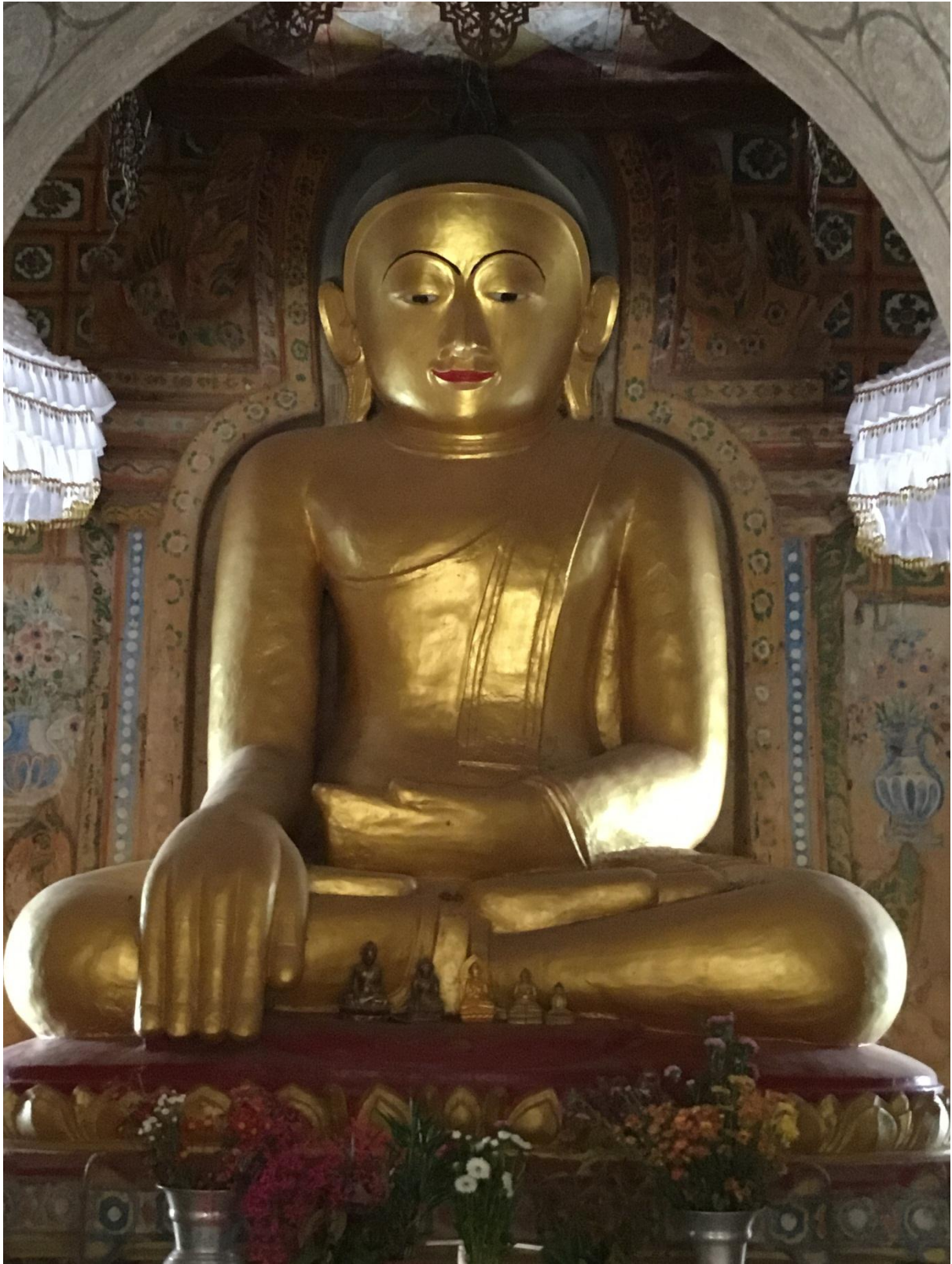
Figure 8- Seated Buddha image with mural painting background inside Lemyethna pagoda which was built in 1222 AD.