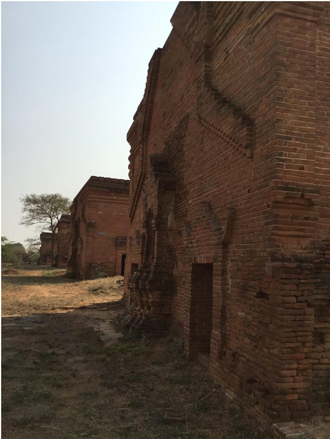
Figure 10- Monasteries inside Hsinbyushin systematic Monastic Complex which was built by King Thihathu of Pinya in 1311 AD.