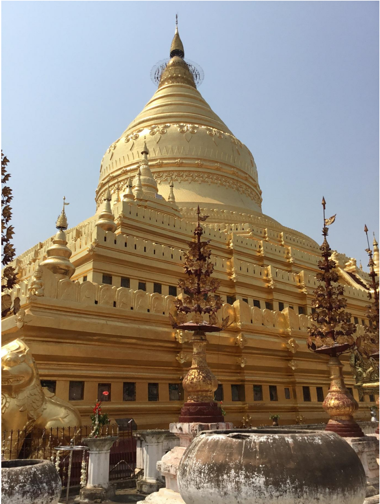
Figure 2- 'Shwedagon,' enshrined several Buddha relics including a copy of scared tooth relic from Kandy, was built by King Anawrahta.