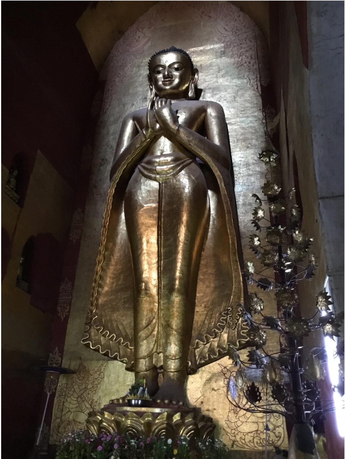
Figure 3, the teak wooden 9.5 metres tall gilded image inside Ananda pagoda which was built by King Kyansittha in 1090 AD.