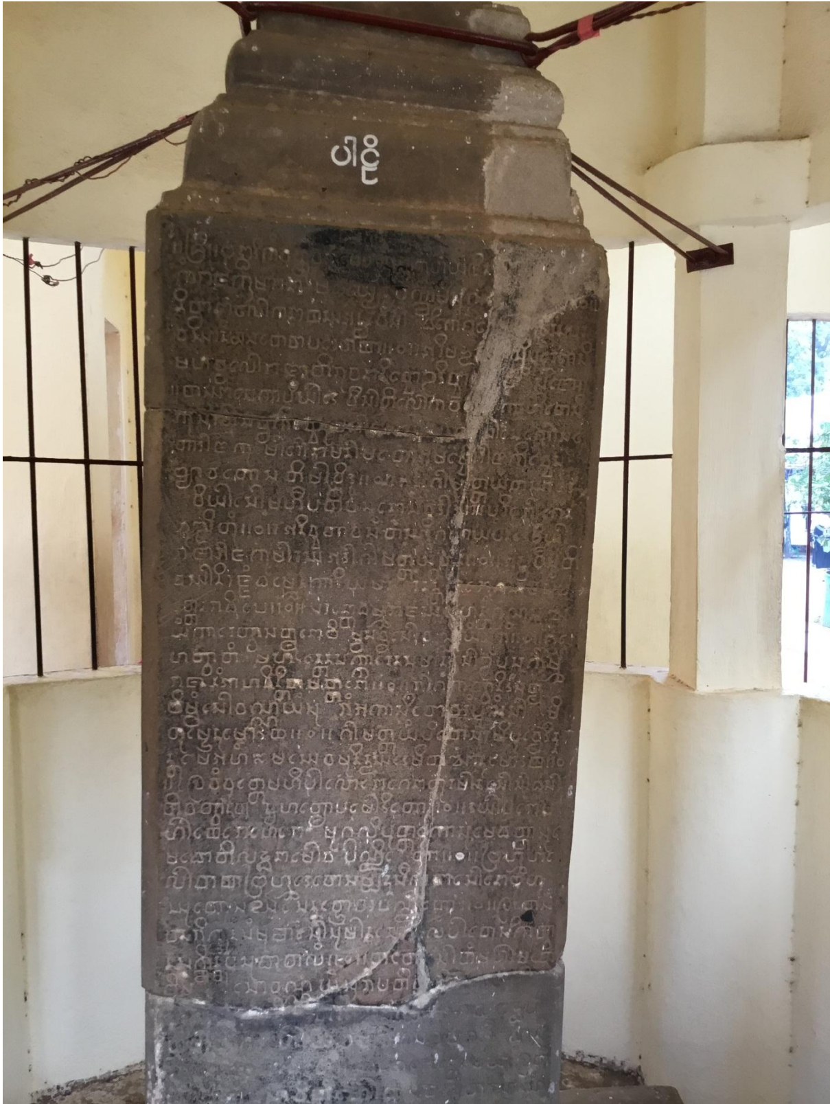
Figure 4- Stone inscription by Prince Rajakumara, son of King Kyansittha in about 1113 AD which measures 36cm width and 138 cm height each of four sides' inscribed Pali, Pyu, Mon and Myanmar.