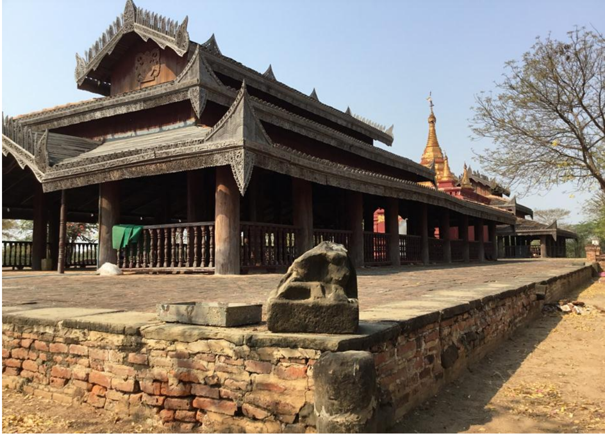
Figure 1- Araham Sima, ordination hall which was consecrated and built by Shin Arahan and King Anawrahta. Upper wooden structure is later renovation only.