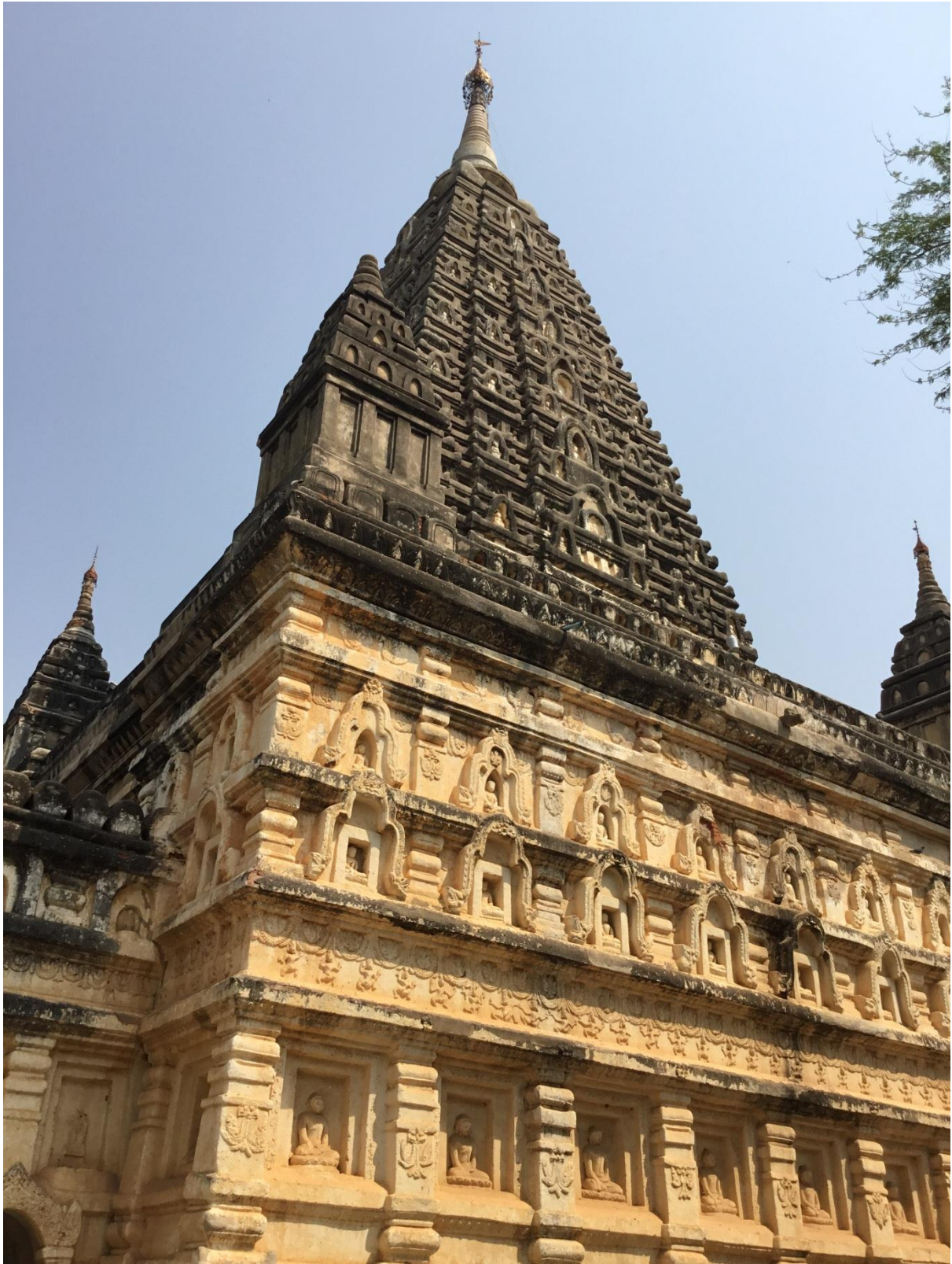
Figure 7- 'Mahabodhi' of Bagan, modeled after the famous Mahabodhi in Bihar, India in 1215 AD.